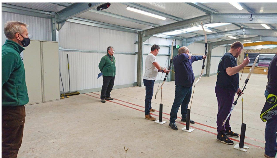
Covid19-secure taster session, January 2022

All the best and many thanks to everyone who supported our archery club and this project.